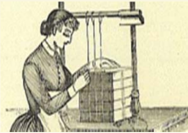
SEWING BOOK BLOCKS

Weekend Introductory Bookbinding Courses are run at our professionally equipped Ralph Lewis Bindery at the NSW Writers Centre at Rozelle. (See directions on the back).