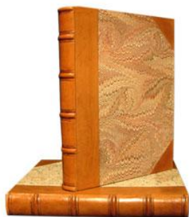
Art of Bookbinding - Berrima

Prize (Voucher) for the best Leather Bound Exhibit in Book Binding Classes 237 to 239, supported by Birdsall Leather & Crafts. Value $50